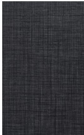
Wilsonart Blackbird 5024K-19