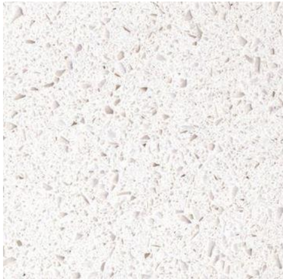
Silestone: Blanco Maple 14