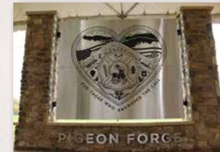
The Pigeon Forge wall dedicated to "Those Who Answered The Call"