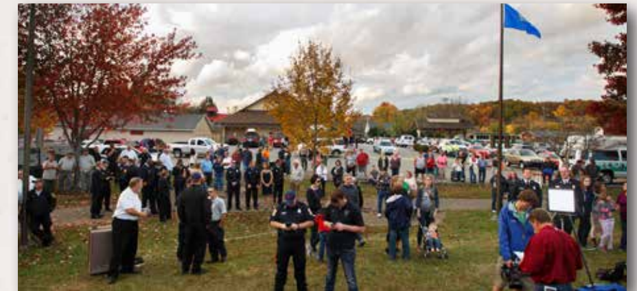
First responders, family, friends and television crews awaiting the big reveal.